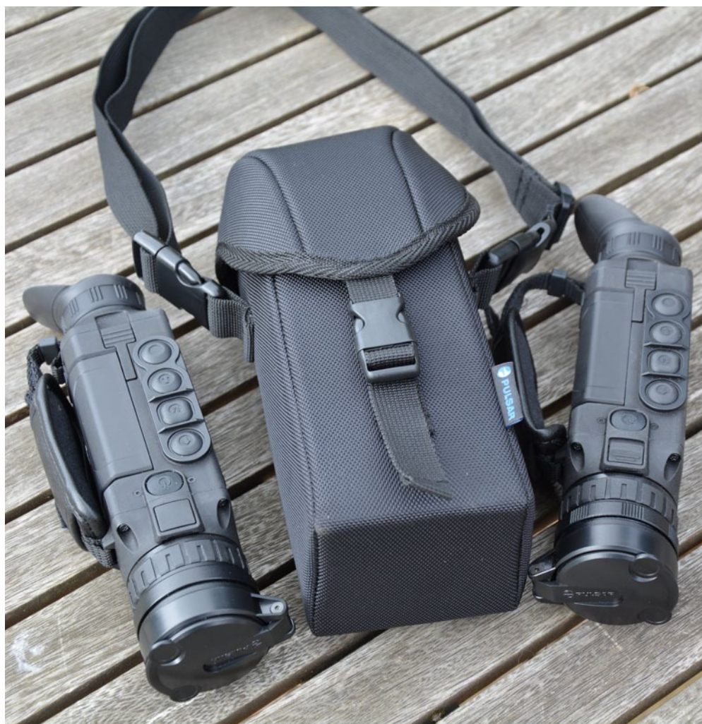
ABOVE: Pulsar Helion XP on the right, the XQ on the left

A flip-up lens cover protects the 50mm objective lens and will rotate through 360 degrees to suit your preferences. The image focus collar sits behind this for regular usage in the field, with a similar collar at the rear to focus the internal screen. At the back there is a rubber eyecup with a wing-collar sealing to your eye socket, blocking out external light. As always, if you stay glued to it for too long you lose your natural night vision in one eye as your pupil will close, and you also get some condensation forming on the external glass from your body heat. The