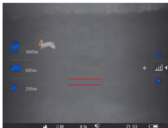
BELOW: Rangefinding capability is hampered by the slow and heavy button presses while trying to maintain 'aim'

collar rotates with detents inbuilt so, when it's set, it stays set for either your left or right eye and won't get nudged. An adjustable padded Velcro strap wraps the back of your right hand over the battery, which I'm sure has the added benefit of keeping your hand in one position and keeping the battery a little warmer, too. It happily copes with any hand size and adds security to your grip, allowing your four fingers to sit atop, almost aligned with the buttons. I found my fingers naturally fell on the three rearmost buttons with my index behind them, not on a button.