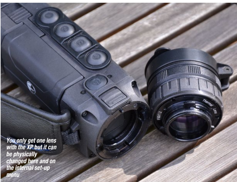
You only get one lens with the XP but it can be physically changed here and on the internal set-up menu

keep this to mean showerproof at most. The single 1/4" mounting point for the unit to a tripod is forwards of the battery, which is the main mass in the 590/595g weight of the two items, and this provides a solid anchor point. I liked the twin side mounts on the Quantum, allowing you to fit a strap similar to that on a pair of binoculars so they would hang around your neck freely when you are otherwise occupied. The location here means the centre of mass is higher than the mounting point, so it won't hang naturally upright or flat to your chest, which is a shame as it twists around too. The benefits of either are hard to accumulate. The XP benefits over the XQ because of its lower magnification capability, which seems to disappear when you use like for like 4.1 digital zoom to compare against the XQ's optical zoom; yet at close range, when rattling for example, the low magnification and greater sensor resolution of the XP is stunning, but cannot be compared against that of the XQ. It's tricky but, when it comes down to it, money is easy to compare and for general vermin control, the XQ is better value and dropping to a 38 gets the lower mag. Really look at your land before choosing: if you walk, go low; if you drive and have huge fields to scan... I could go on and on. RS