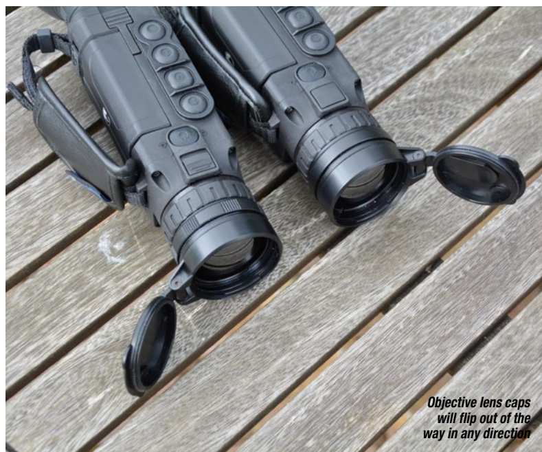
Objective lens caps will flip out of the way in any direction

So, after all that, where does it leave us? Well, if I had to have a 50, I would go with the XP because it has lower magnification, and therefore a wider field of view and more comfort when walking. On the other hand, I could just get this and significant pocket change from the XQ38 – though it is a supposed 450m reduction from the 1,800m detection range of the 50s, it doesn't seem to matter in the real