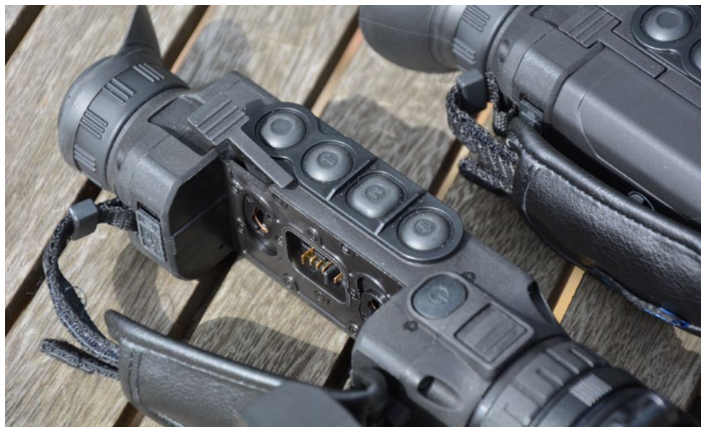
ABOVE: The locking latch for the battery clamps the terminals in place